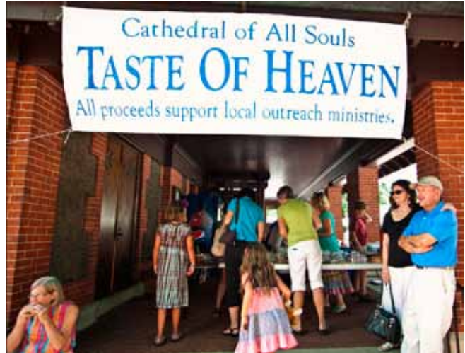
Food Booth 2011

Ice was toted, cases of bottled beverages were man-handled, money was managed, wares were hawked and a good time was had by all. This year's volunteer effort was perhaps the greatest ever. So many volunteers did so much, individuals cannot be named.