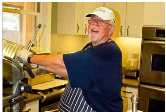
Food Booth 2011 5

We will gather on September 28 at 12:30 p.m. in Zabriskie Hall for our pot-luck luncheon and program. Today we shall be flying off to China and watching a DVD entitled "The Forbidden City: Dynasty & Destiny." This is the largest palace complex in the world, and those of you who have seen it can testify to what an extraordinary structure it is. Come and bring a dish to share, make new friends and enjoy the fellowship.